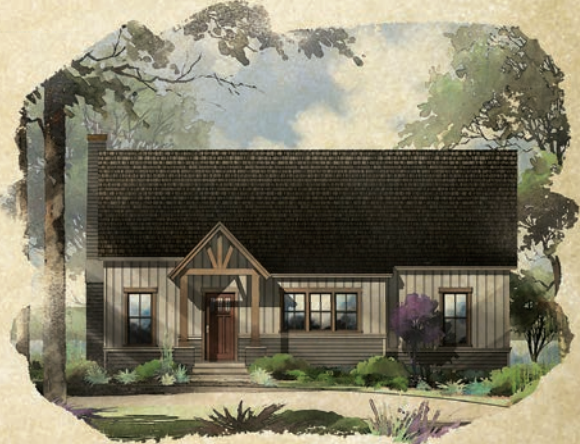
Street Side Elevation

Total square feet - 2,551 | Conditioned sq. ft. - 2,068 | WhiteOakLandingLM.com